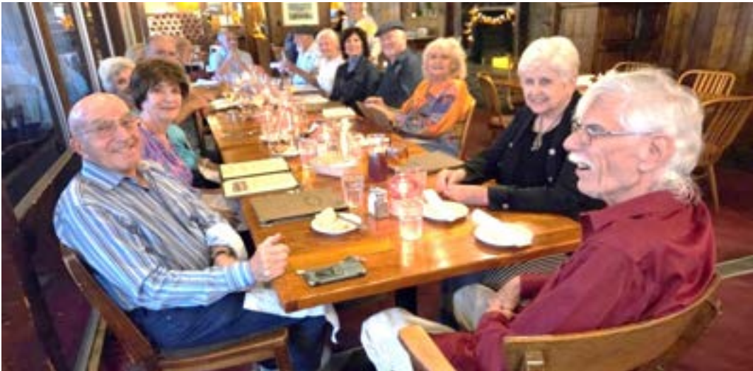
We are seated for dinner and everyone looks happy.