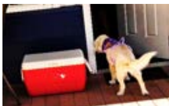
Gigi checking out the cooler