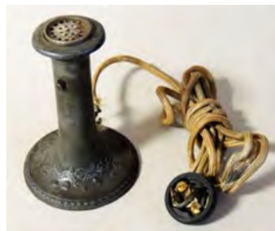
This is the lighter. It was called the reel type. The description of how it worked looked a bit unsafe to me.