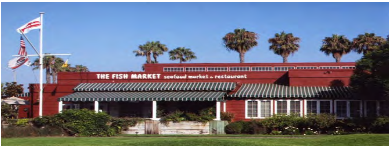
We arrived at the fish Market in Solana Beach just in time for lunch.