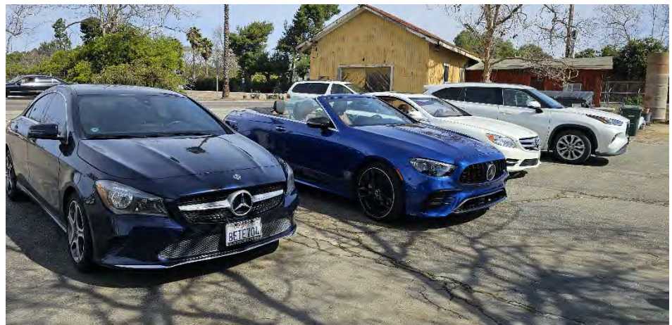
An assorted line up of Mercedes. The first white car is Roger Shweid's, is a rare, one year only model S580.