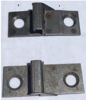
1935-39 Junior Hood End Anchors

A sample of what we have to offer, plus much more