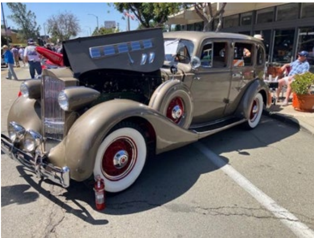
A visiting Packard