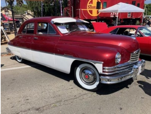
1949 Super Eight Touring Sedan