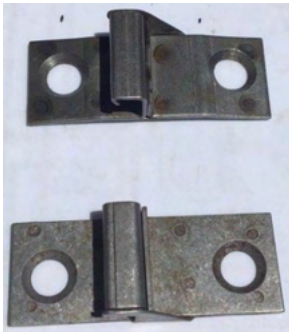
1935-39 Junior Hood End Anchors

A sample of what we have to offer, plus much more