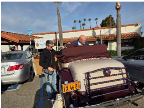
The Pisanos taking down and storing the top the ol' school way.