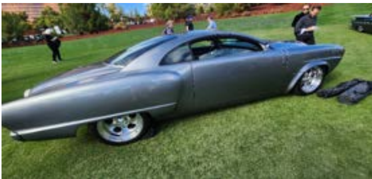
Yes, this is a Studebaker.