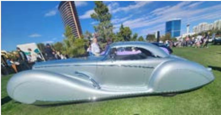
1934 Packard Aquarius