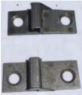
1935-39 Junior Hood End Anchors

A sample of what we have to offer, plus much more