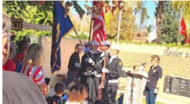
The Naval Sea Cadet Corps trooped the colors