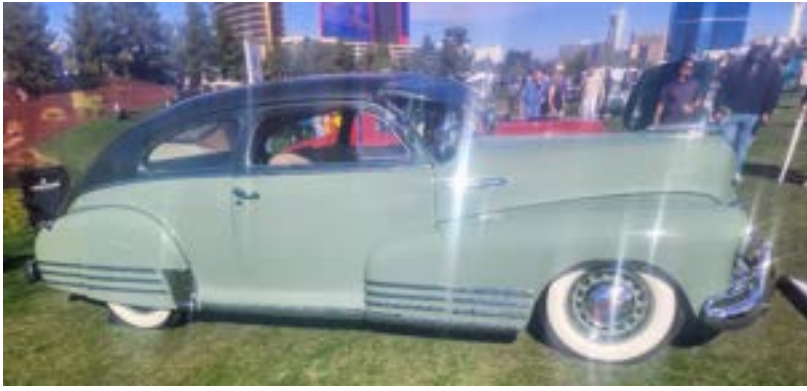
A very nice 1948 Chevy Fleetline. This car drew my attention because my Dad had a 1947 when I was a kid.