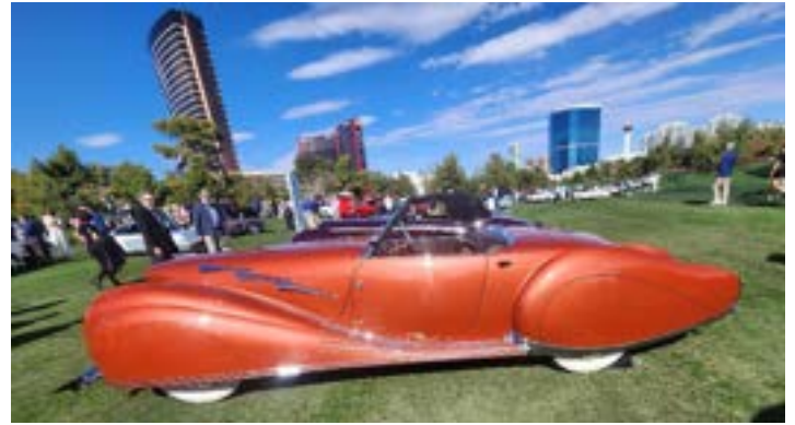
A very nice 1947 Delahaye 135MS a class winner.