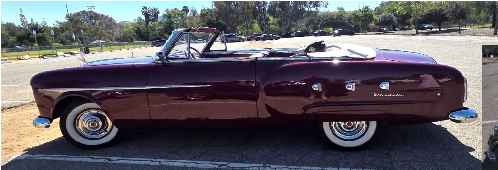
Ian Sandfer's 1951 250 Convertible