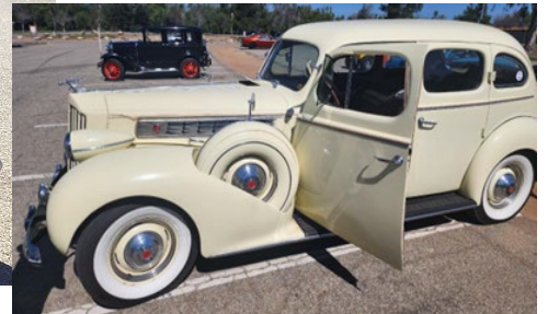
1939 Super 8