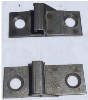
1935-39 Junior Hood End Anchors

A sample of what we have to offer, plus much more