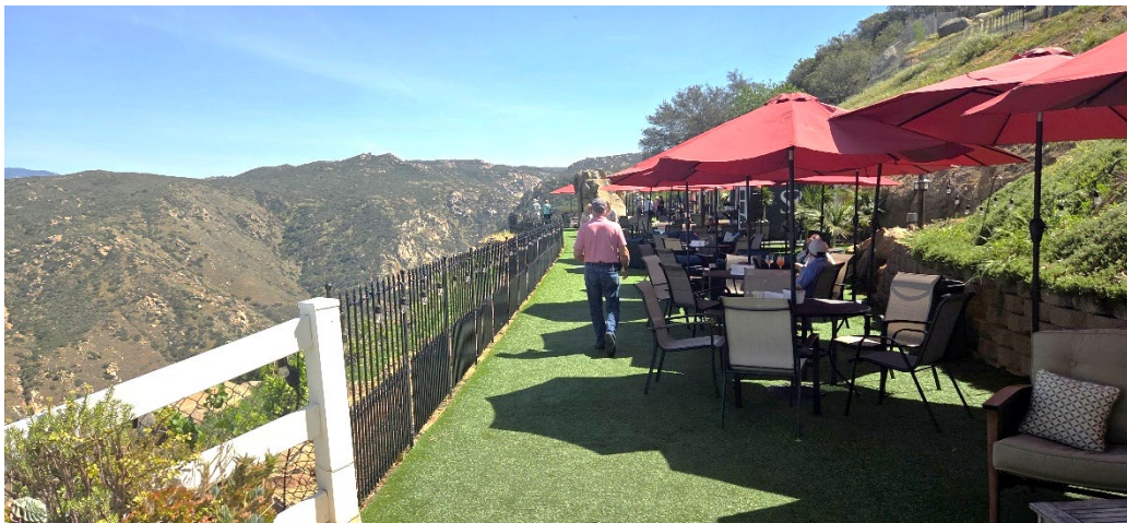
Our dining area.