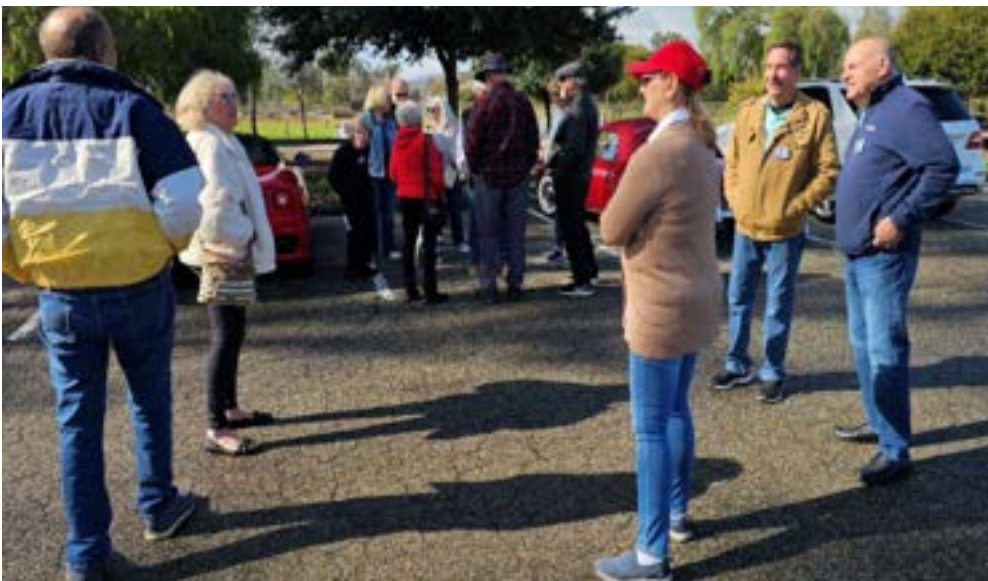
Waiting for more cars to join us.