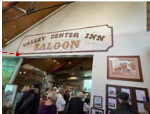
This is the original sign from the Valley Center Inn and Saloon