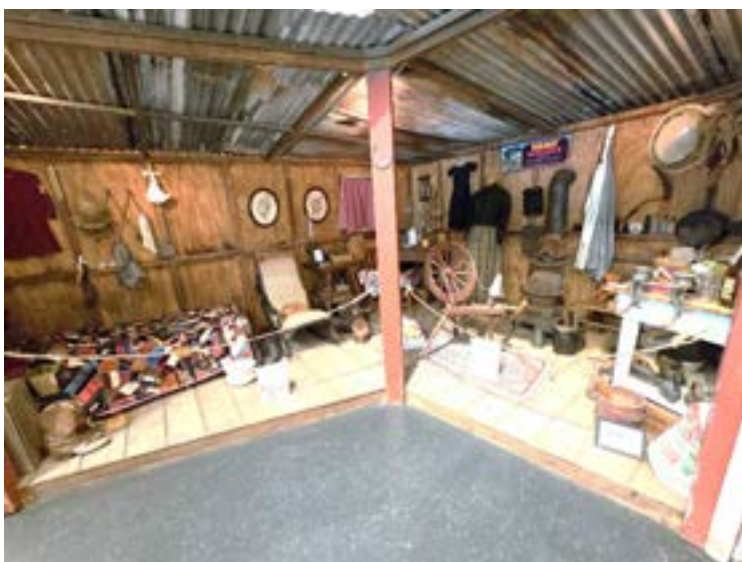
This is a replica representing the early dwellings, built by the first settlers of Valley Center.