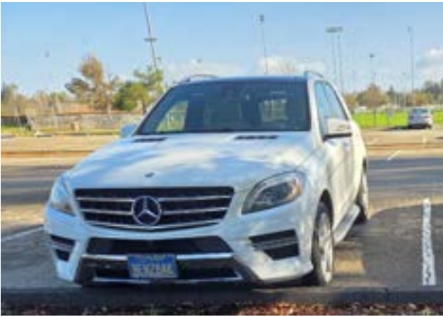
Rudy Wokoek's ML