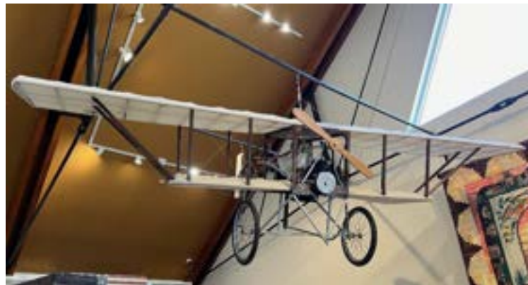
In 1909, Donald Gordon, an aviation pioneer, achieved the distinction of being the first person to fly a powered aircraft west of the Mississippi River, launching his homemade biplane from a Valley Center barn.