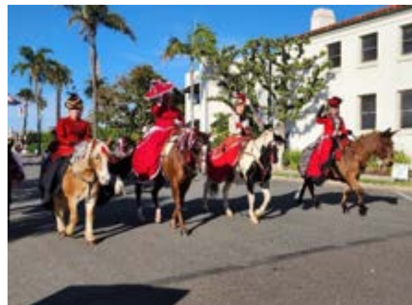
A few of the horses and riders in the parade.