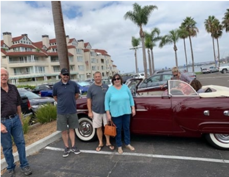
Pit Stop at Glorietta Bay