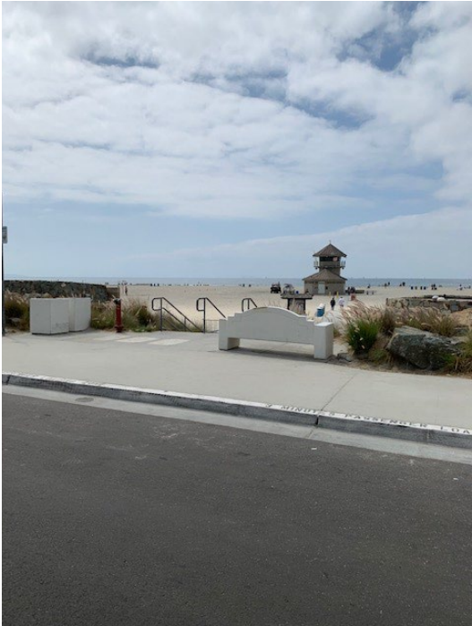
Driving on Ocean Blvd along the boardwalk.