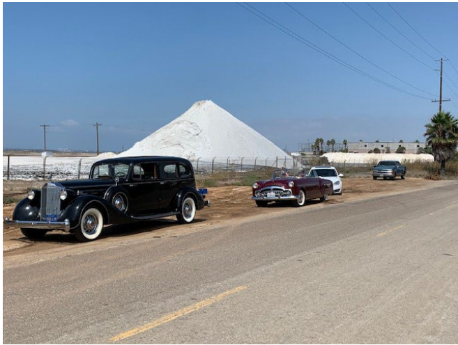
La Punta Salt Works