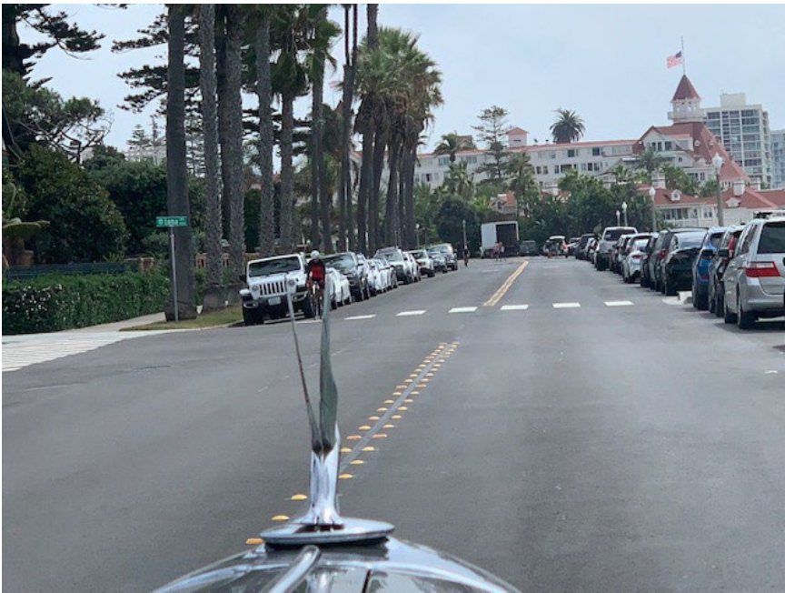
Ocean Blvd, approaching Hotel Del Coronado.