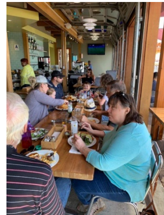
Lunch at Pier 32.