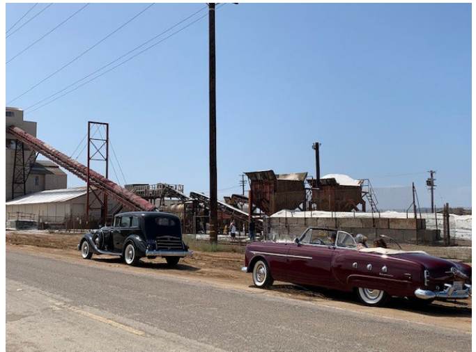
La Punta Salt Works conveyor