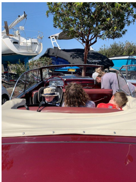
Preparing for Departure. A mother's Job is never done.