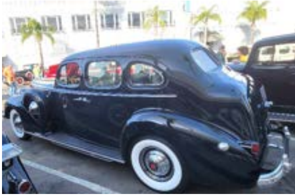
Todd Schonenberg's 1939 Super 8 Touring Sedan, a well restored Packard and an excellent touring car. The big straight 8 engine and over-drive enables it to maintain freeway speed comfortably and safely.