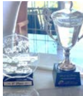
This is the Best In Show trophy that Tom won at the Huntington Beach Car show