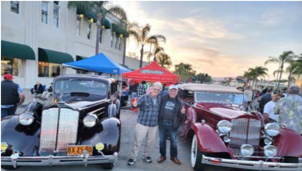
Our two winners give us a thumbs up as the sun sets on Crusin Grand