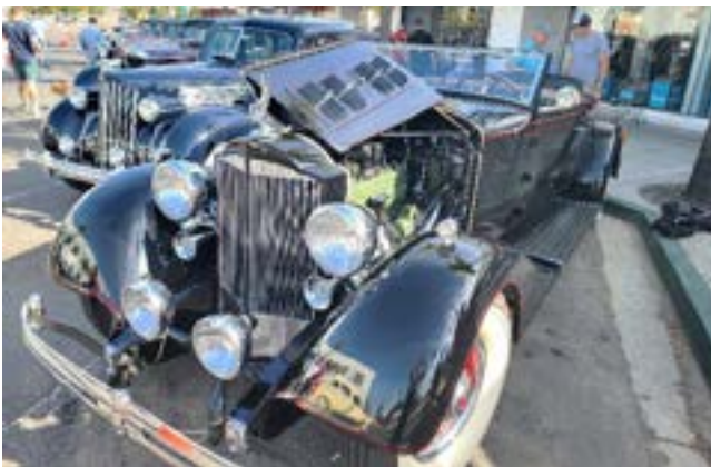
Tim Pestotnik 1934 Convertible Coupe