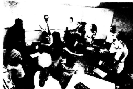
This goes up & down and this turns.