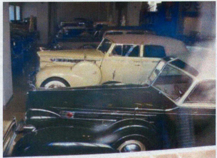
A line of 4 Packard cars