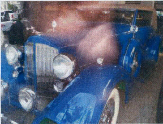
1934 Convertible Victoria

Following are just a few pictures. Sorry for the poor quality. Glare off the window glass spoiled the view a great deal. Have any of our members been to San Francisco and actually visited this find display of cars? If so, who is the contact? Before our next trip I really must do research and see about setting up a tour. The opportunity is tantalizing, isn't it?