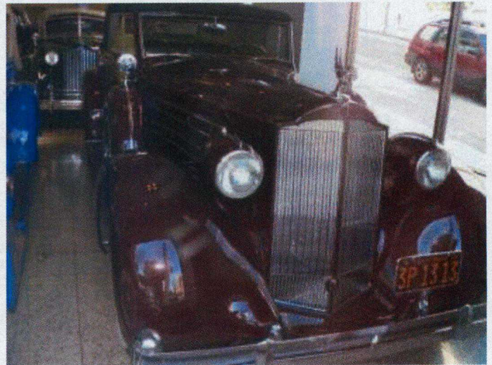
1935 12 Cyl.