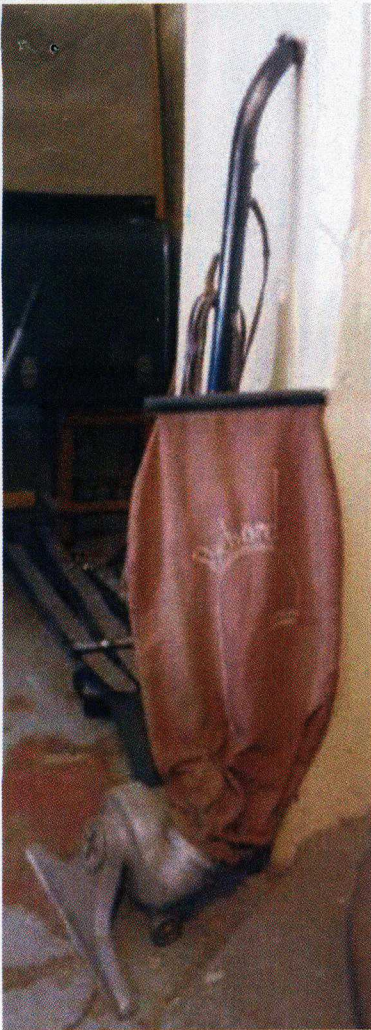
Packard Vacuum Cleaner