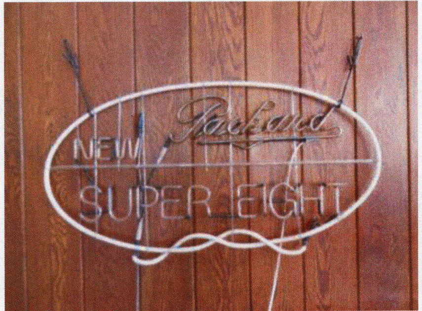
NEW Packard SUPER EIGHT neon sign