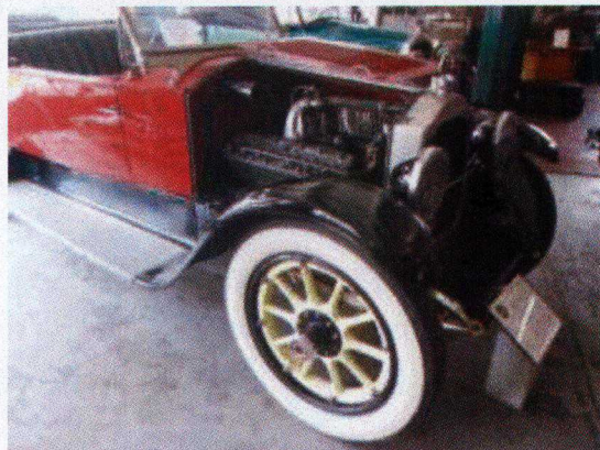
'18Twin Six, Model 3-35