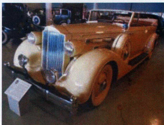
'35 Twelve Convertible Sedan, Model 1208