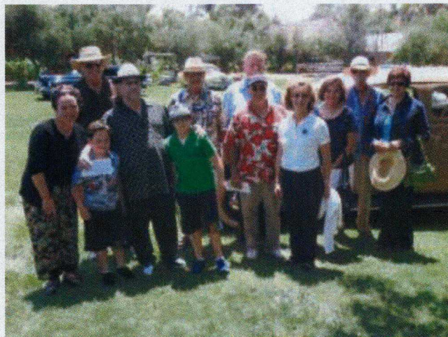
Circle of Champions Award Winners