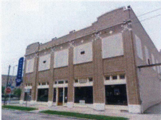
The Citizens Motor Car Company