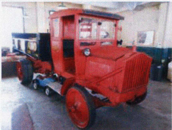
'19 Packard Model E, Five Ton Truck