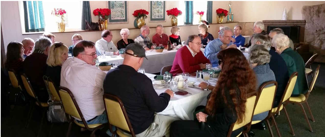
Most everyone is seated and eagerly awaiting the roast beast and red snapper