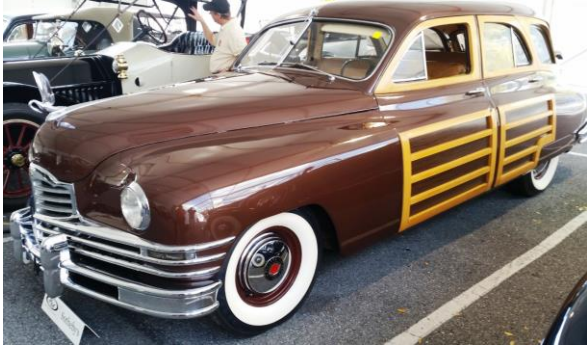
1949 Packard Station Wagon (I prefer Estate Wagon). It sold for $60,500 which included buyer and seller fees.