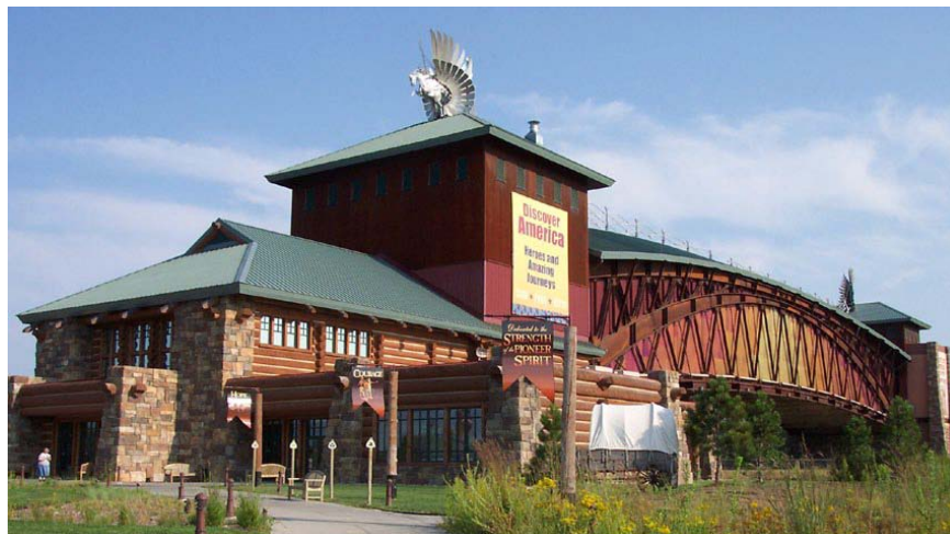
Meeting point in Kearney, Nebraska