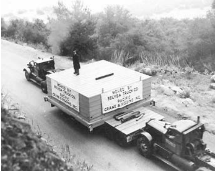
THE 200 INCH MIRROR GOING UP THE ROAD IN 1948. IT TOOK THREE TRUCKS TO GET IT UP THE MOUNTAIN