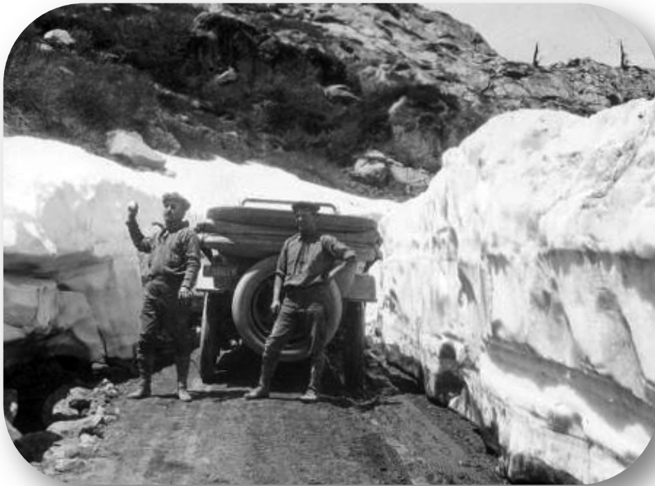
Lincoln Highway association president Henry Joy takes a break for fun in the high snows This was probably taken in the High Sierra Mountains

In the photo above I wonder how the snow was plowed. Horses?