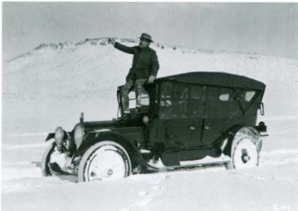
Could this be Henry Joy pointing the way to his driver/mechanic?