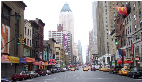
Times Square departure point

In the photo above I wonder how the snow was plowed. Horses?