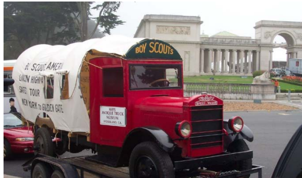
San Francisco departure point