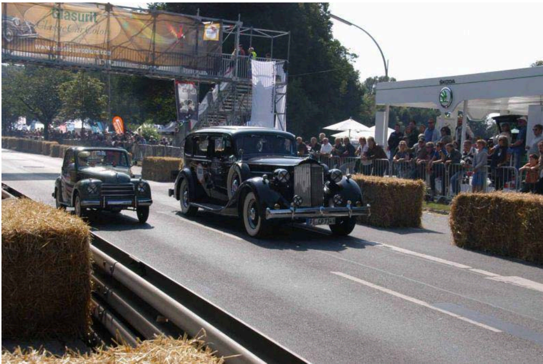
On the track in fight with a Fiat Toppolino