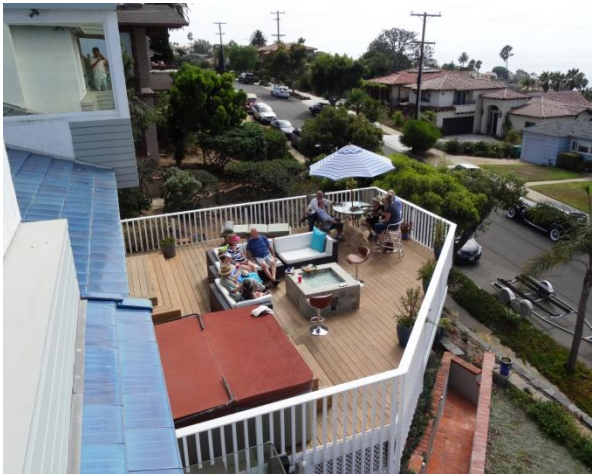
Roof top shot.