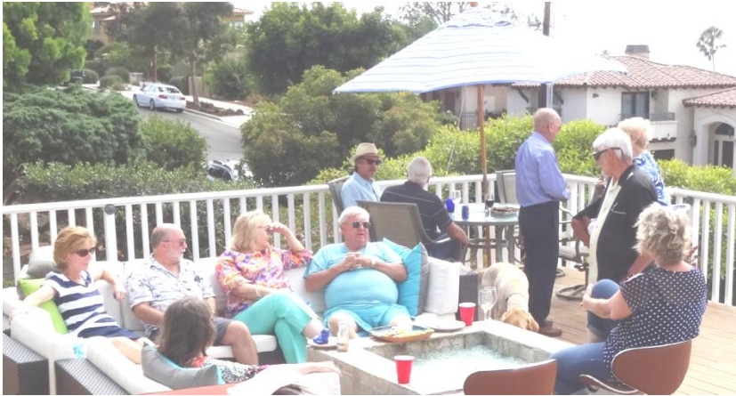
The deck bunch.