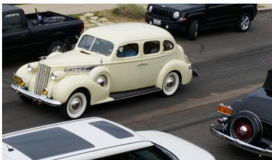
Buttercup arriving. The rear of Tim's 34 is on the lower right corner of photo.

And so it was a varied and very interesting group of people who gathered at Tim's house. Everyone ate their fill, got in a great deal of relaxation time, and topped it off with champagne at the end of the day. Tim went all out.