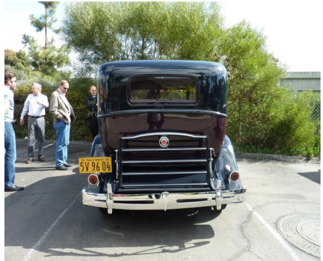
Rear view of Miss Za Za. We don't like to mention age but her license says 1934

When finished with the "Eye Candy" we adjourned to the dining room and enjoyed a delightful meal from the Elephant Bars extensive menu selection. It was a great fun day and if you missed it there is another chance for an even bigger event this month