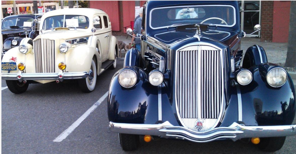
1939 Super 8 beside a 1937 Pierced-Arrow V-12 touring Sedan