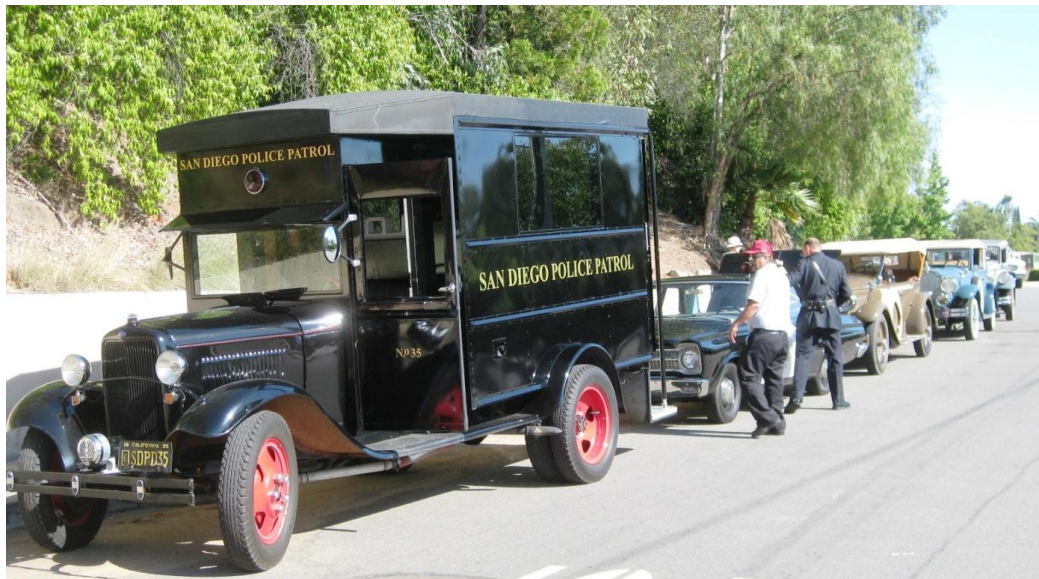
Ready to roll, parade cars stretch back as far as the eye can see.

What happens when you get group of Packards and Pierce-Arrows classic vintage automobiles together? Well you have a parade and then a car show that's what happens! If you have a parade one needs a police escort so enter the San Diego Police Museum? We were led by a 1935 Ford Paddy Wagon. We are all thankful that it was not needed in an official capacity. Thankfully the Shyster Gang did not make an appearance.