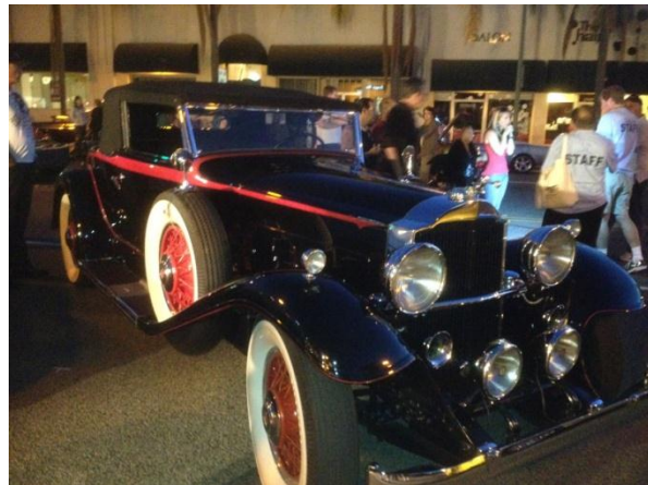
In the Winners circle