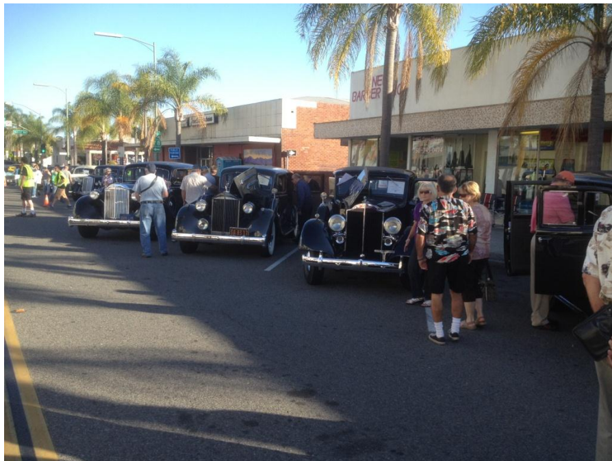
Grand Packard row all from the mid thirties.