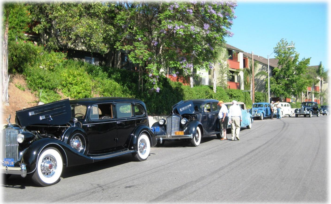
Staging for the parade