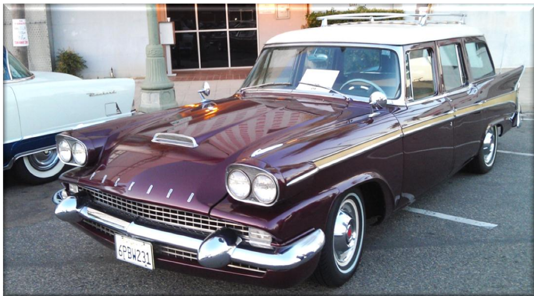
Colin Fort's very rare 58 Station Wagon. The youngest car in the show.