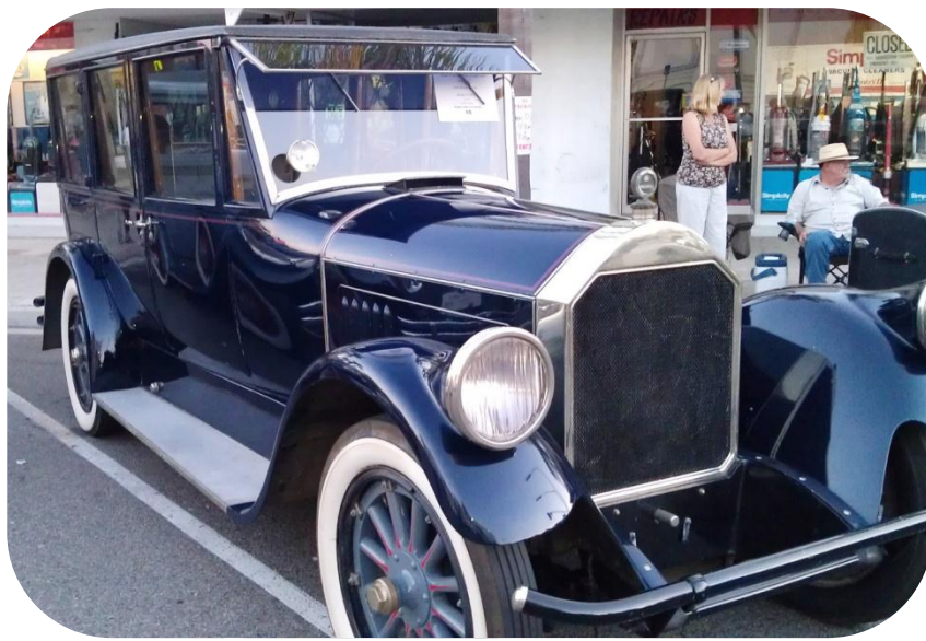
Oldest car at the show, a 1925 Pierce-Arrow