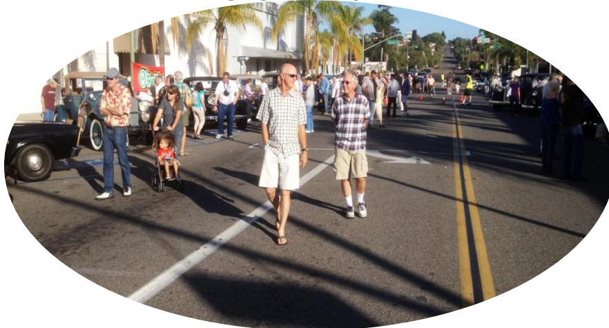
Looking down left side of Broadway