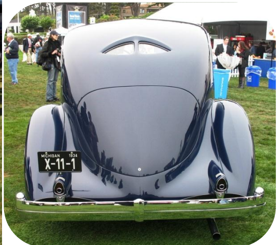
Note the striking similarity between the Pierce-Arrow concept Silver Arrow on the left and the 34 Packard on the right. According to the owner of the Packard shown here only 7 or 8 of these models were built and some were destroyed.