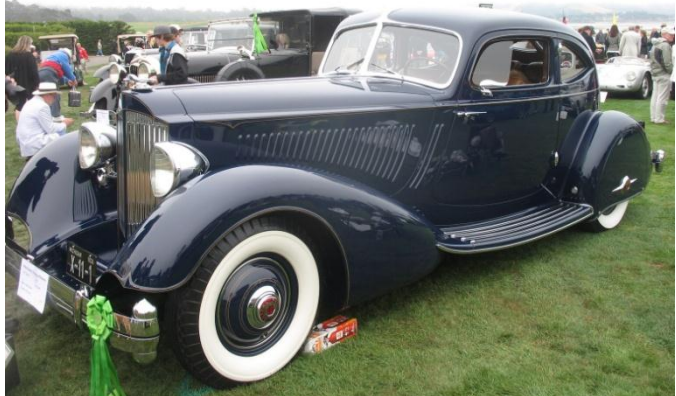
1934 Model 840 A Pierce Arrow Silver Arrow and a 34 Packard. This Pierce was based on the 1933 Silver Arrow concept car as shown