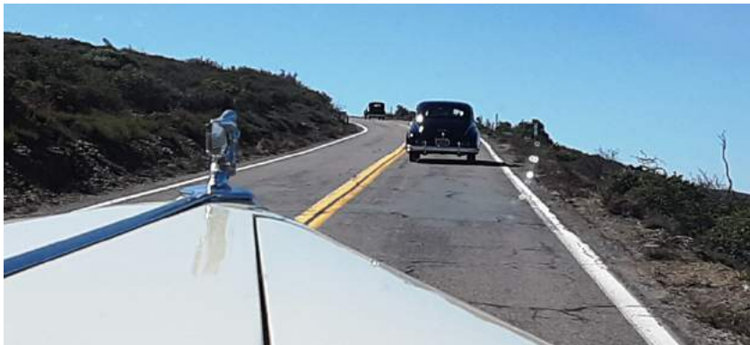
Saturday morning at 9:45 a driver's meeting was held in the parking lot at the Apple Tree, followed by the 17 mile drive through Julian south in Hwy 79 to the Sunrise Highway and on to the Kwaaimii Point turnoff. The desert overlook is breathtaking. On a clear day visibility is in excess of one hundred miles east toward Arizona. Saturday morning we could not quite see that far due to the dust from high winds.