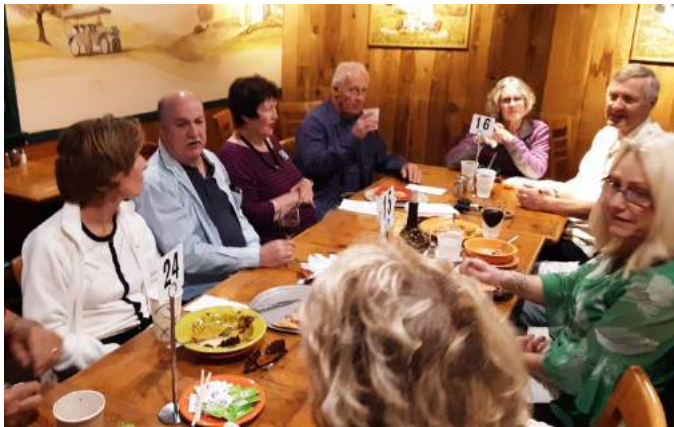
Friday folks were welcomed at our room for snacks and libation. Everyone was so full that appetites were sparse when we walked across the street to the Wynola Pizza & Bistro.