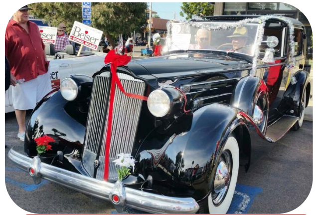
Rick Habicht ready to head out