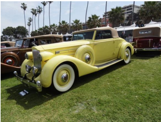
1937 Twelve Convertible Roadster