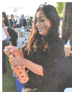
One of the many lovely ladies serving a variety of libations and exotic fruit beverages during the show.