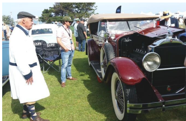
Packard Doctor K. Ramsing stands ready for consultation if needed.