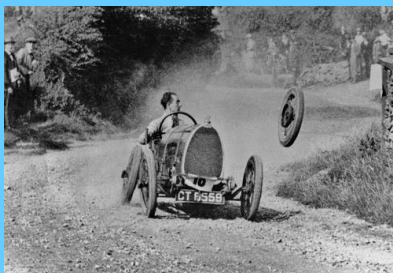
This is a mid 1900's Bugatti

Mark your calendar (does anyone use a calendar anymore....What? With smart phones?) for July 16, 2017 for a fun filled, exciting, breathtaking rallye on some scenic back roads of San Diego County. While motoring and looking for clues the driving teams will be given the opportunity to learn fun facts about our American Heritage. I can feel the excitement now. You may win priceless trophies and other accolades for your powers of observation and eighth grade knowledge of your American history and our heritage.