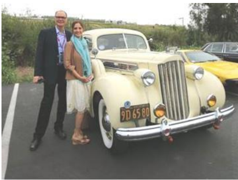
Gathering for the tour at symbolic Motors