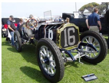
1912 Model 30 Racer. The tire were a bit worn and were soft rubber racing tires, leading me to believe this Packard is still racing, probably in vintage races.