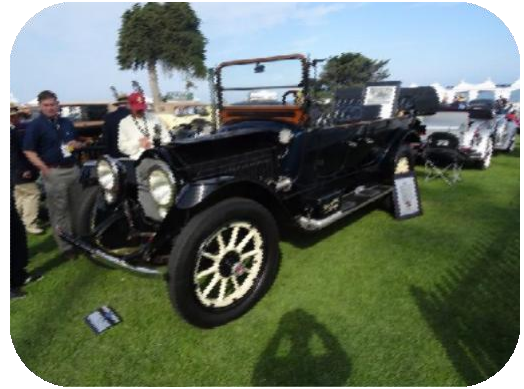
1912 Twin-Six owned by the La Jolla Beach and Tennis Club. Delivered new in San Diego