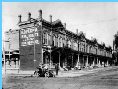
Brick Row 1911

Friday April 14, 2017, 10:00 am to 2:00 pm