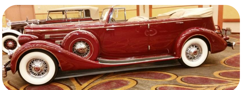
1935 convertible Sedan, owned by General Lyon