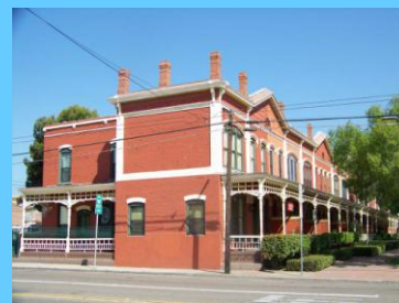
Brick Row today

The ladies of the National City Historical Association are holding a fund raiser event to benefit elderly residents of the community and a Down syndrome charity. Open to the public the ladies will welcome guests dressed in their stunning Victorian costumes. Tours will be held and food will be available. Topping it off will be a collection of collector cars dominated by Packard. Members do not need to sign up, and there is no fee. Lunch will be provided for those who generously bring their cars. We appreciate this opportunity to give back to the community, so hopefully there will be an enthusiastic turnout. Packards will park in the center of Heritage Park.