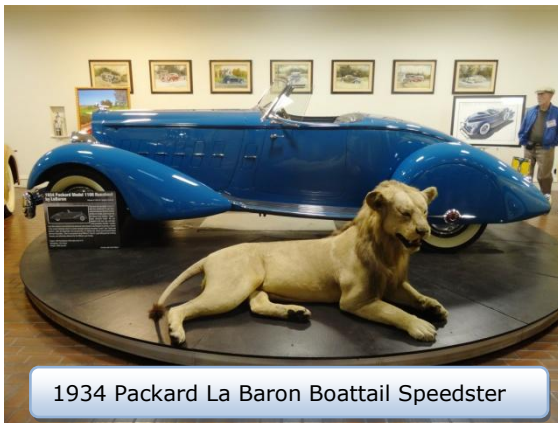
1934 Packard La Baron Boattail Speedster

As I write this, the annual P.I. National Membership Meet for 2017 has just concluded. Stalwart people braved the weather to come out and have a good time. Come rain or come shine months of planning were concluded and the events unfolded.