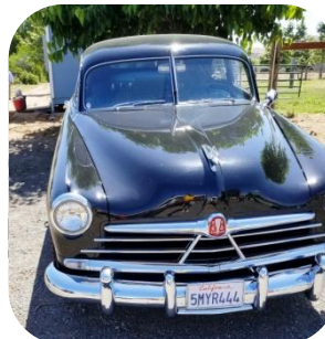
1909 Hudson, I Think 1950 Hudson Coupe