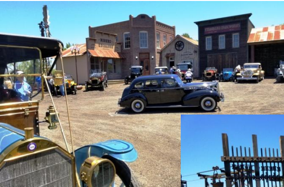
A very nice 34 Packard parked next to an early Hudson