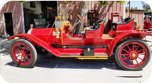
The 1909 Delage and a 1934 Morgan and a couple of very nice Pierces