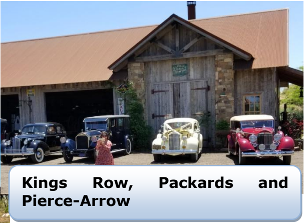
Kings Row, Packards and Pierce-Arrow