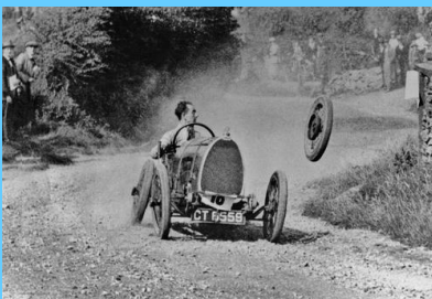
This is an early 1900's Bugatti

Mark your calendar (does anyone use a calendar anymore what with smart phones?) for July 16, 2017 for a fun filled, exciting, breathtaking rallye on some scenic back roads of San Diego County. While motoring and looking for clues the driving teams will be given the opportunity to learn fun facts about our American Heritage. I can feel the excitement now. You may win priceless trophies and other accolades for your powers of observation and eighth grade knowledge of your American History and our heritage.