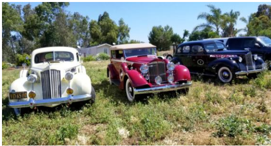
Packards in the weeds. Buttercup is right at home.