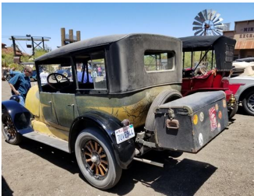
1923 Franklin that looks pretty much original