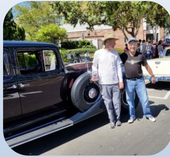
The Trophy Boys